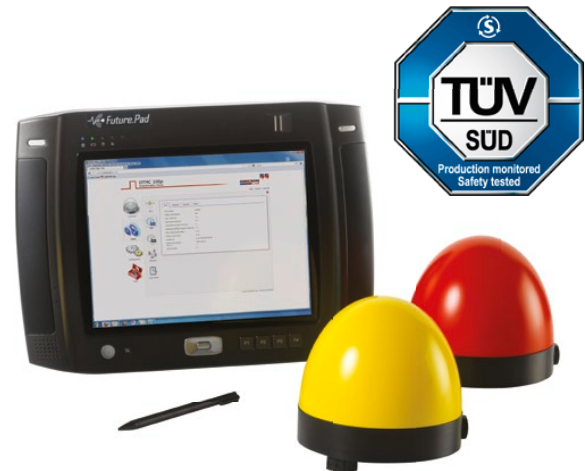
OTMC 100 Series with Tablet PC (PC not included)

Windows is a registered trademark of Microsoft Corporation.