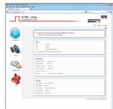
OTMC 100 - Web Interface