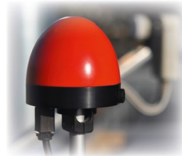
OTMC 100 - Mounting Example

The OTMC 100 series was designed for outdoor mounting in lightning protected areas, so that, if you obey all lightning protection standards, only a suitable surge protection device will be required in most cases to protect your network installation.